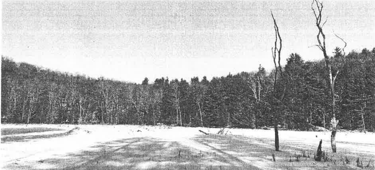
Bull Creek Headwaters "Tourtellot" pond, Townshend