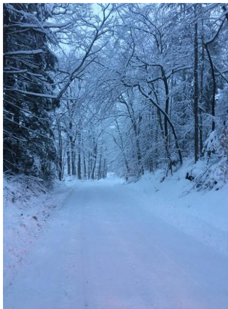
A Snowy Path - Ginger Maciejowski