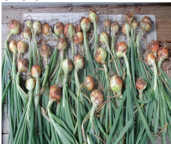
Onion Harvest - Treah Pichette