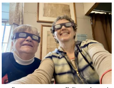
Be sure to get your Eclipse glasses!

small insects to big mammals. Live native animals will be showcased by the Southern Vermont Natural History Museum, and museum educators will delve into the fascinating worlds of bats and our native wild cats. The Magic Forest playscape will be open for play, and