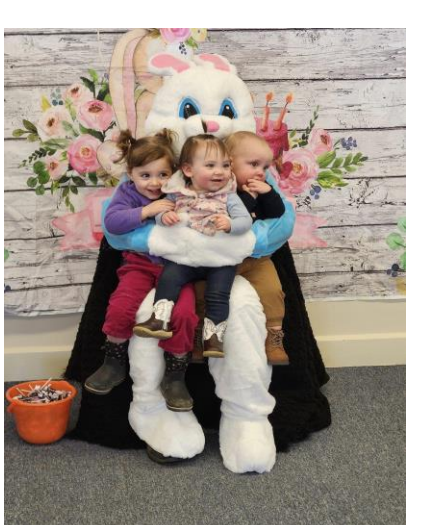
Athens First Easter Egg Hunt

The Grafton Public Library board of trustees is accepting bids for porch renovation work. Bids are due